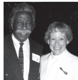
Gordon Parks & Senator Kassebaum

Her special interests are her grandchildren, her husband, and Kansas. Kassebaum Baker was instrumental in the creation of the Tallgrass Prairie National Preserve, comprising 10,894 acres in the Kansas Flint Hills.